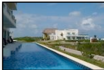
Ground floor are Swim-Up Suites