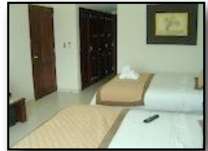
Deluxe Rooms have 2 Double Beds or 1 King Bed