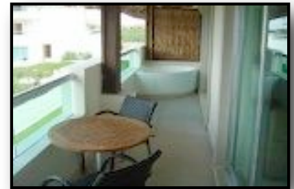
2nd & 3rd Floor Suites have Jacuzzi Balconies